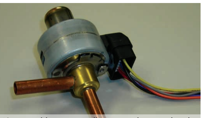
☆Inverter-driven rotary split systems also are unique in that they employ the residential application of an electronic expansion valve to help control the system.

The system is designed to achieve comfort by first controlling